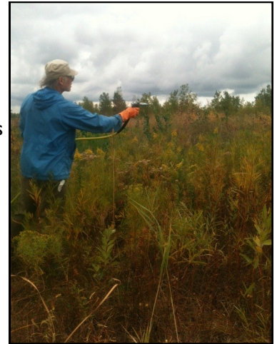
Woody plant control in progress

As part of this project, PNHP is developing a 10-year adaptive management plan to ensure the habitat is not further compromised by invasive species re-growth in subsequent years. The plan will include methods for continued invasive species control, specific inventory and management actions to prevent recolonization of the area by Phragmites and other species treated during restoration activities, and a schedule for monitoring and treatment.