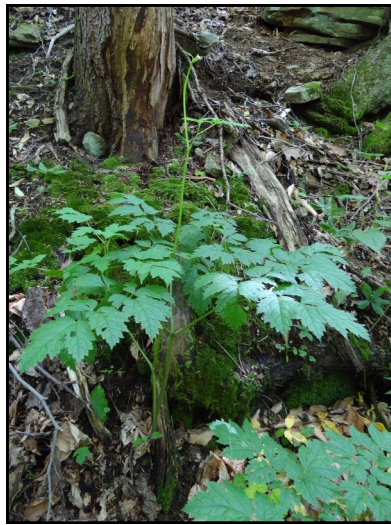
Mountain bugbane ( Actea podocarpa )

Bald Eagle, Forbes, Gallitzin, Loyalsock, Michaux, Moshannon, Sproul, Tioga, and Weiser state forests. Our survey targets included mammals (including bats), reptiles, invertebrates, plants, and natural communities. A total of 144 sites were visited, confirming EOs at 45 of those sites. Of note was the capture of the