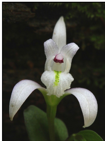
Three-birds orchid ( Triphora trianthophora )

PNHP staff documented a healthy population of three-birds orchid ( Triphora trianthophora ) after following up on a report from an astute naturalist in central Pennsylvania. To our knowledge, this was only the fourth time it has been sighted in Pennsylvania during the past 100 years. The most recent previous sighting of this elusive orchid was in 1987, but unfortunately the habitat where it was seen has since been destroyed by incompatible land use. It is good that we once again know of a viable population of this species in Pennsylvania.