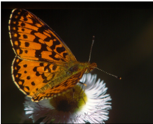
Silver-bordered fritillary ( Boloria selene )