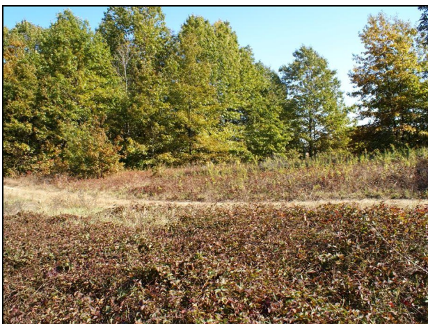
Great Lakes sand barren

In addition to seepage wetlands and shrublands on the 90 foot high bluffs rising from the Lake Erie shore, communities include the Elm – Ash – Maple Lakeplain Swamp Forest, Sugar Maple – Beech Escarpment