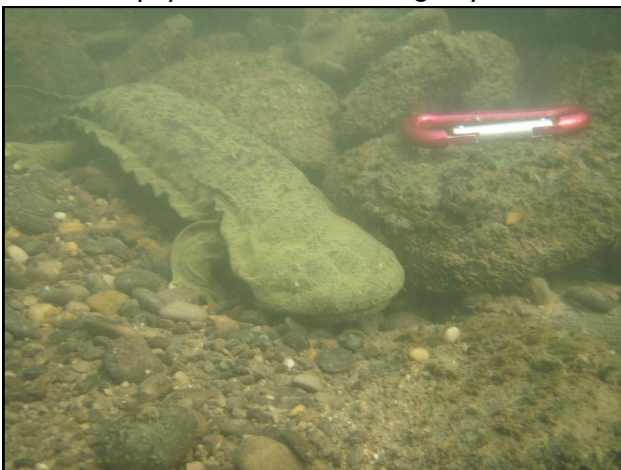
Patricia Morrison, USFWS

During the Allegheny River mussel surveys, we observed two adult hellbenders. They were not under the cover of large rocks but appeared to be on the move in search of females. This discovery extends our knowledge of hellbender populations on the Allegheny River.